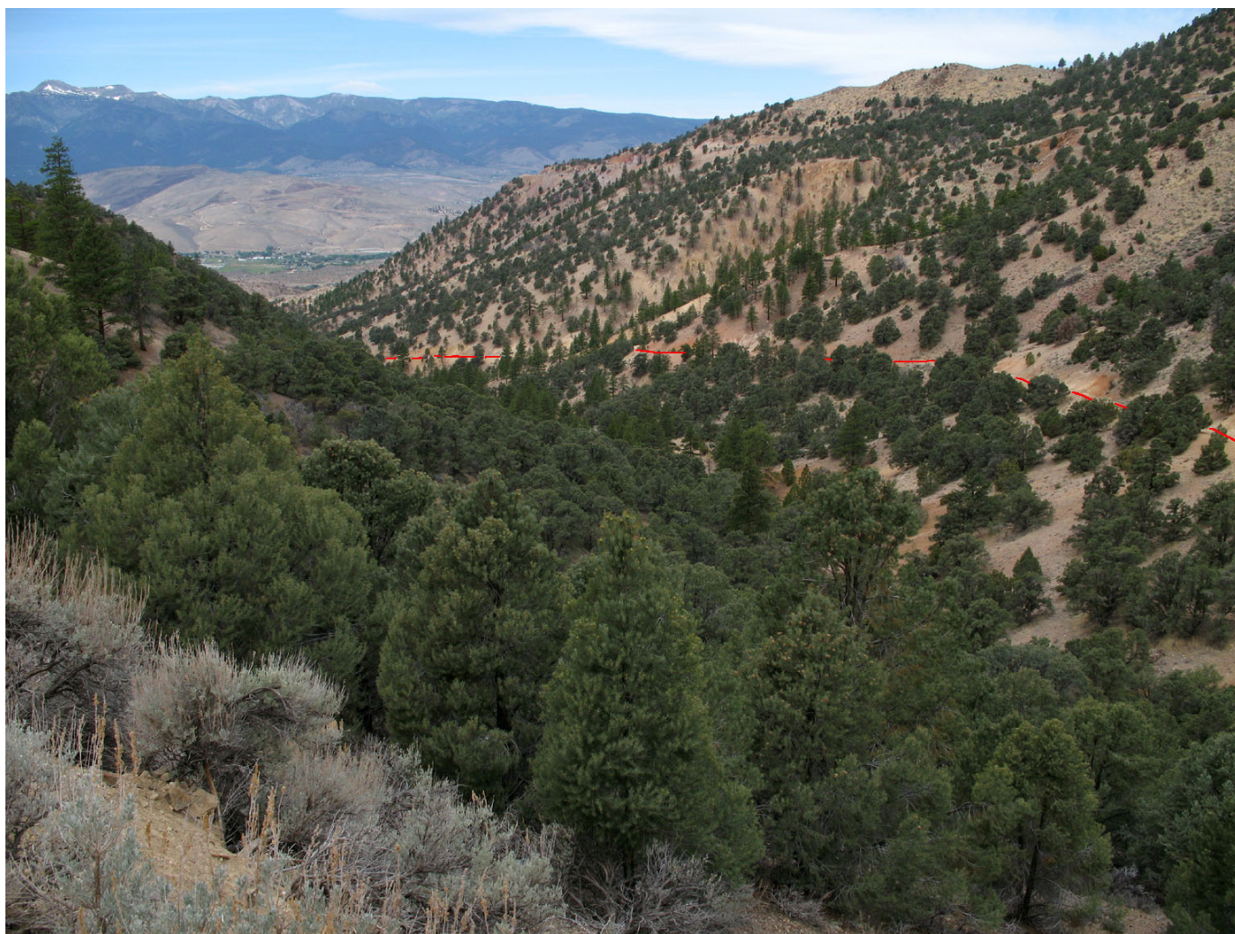
Old Toll Road Climb - Hwy 341 towards Virginia City

From Reno, take Hwy 395 south to the Virginia City exit which is the next to last exit on Hwy 395 which is also the exit for Carson City. Continue on Hwy 395 about ½ mile to the intersection of Hwy 395 and Hwy 431 to the right and Hwy 341 to the left. Take Hwy 341 left or east towards Virginia City. Follow Hwy 341 down hill to the first stoplight and take a right on Old Toll Road. Follow Old Toll Road to the end of the pavement and park here. This is the start and end of your ride. This ride can be done as an out and back or a loop. The climb is written up separately from the loop but both can be added together for the loop. The entire climb is on a jeep road with some loose sections, some steep sections, but all rideable. If you come down the climb, be careful on the corners. If you do the loop, be careful on the down hill section of the loop. Some sections are loose, and off camber.