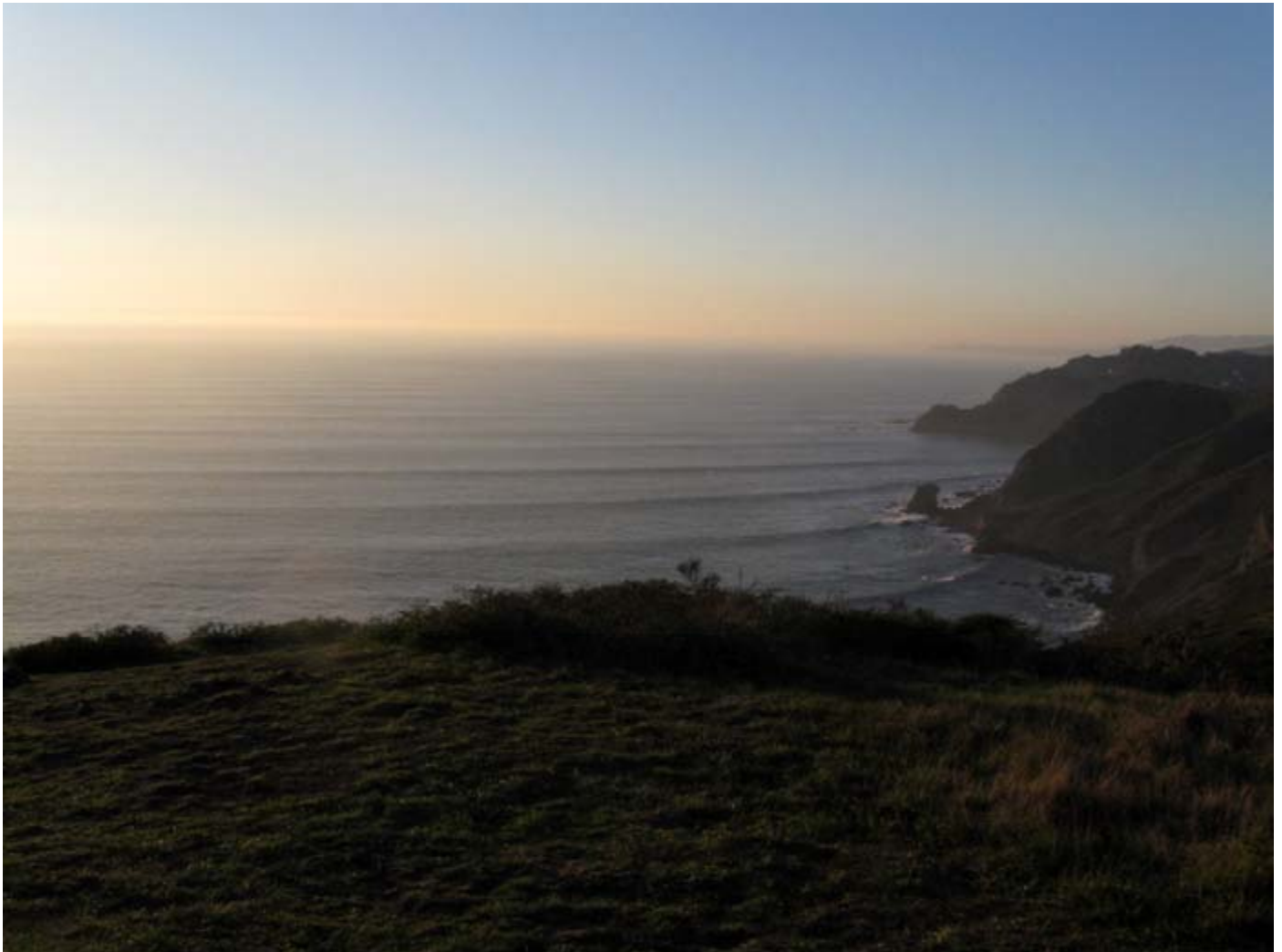
View from Coast View Trail Towards Muir Beach

The big question here is how to get to the trail heads. There are so many ways to get to the trail heads, that I will just pick the main access from a major freeway or road, then give directions from there.