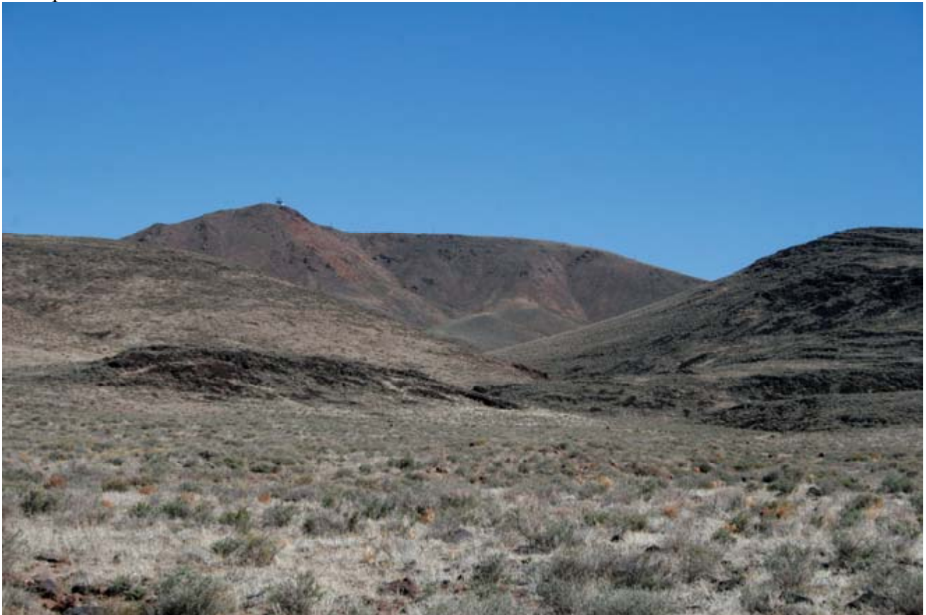
Focus on You Photography Churchill Butte

From Reno, take Hwy 395 S. to Carson City. Continue on Hwy 395 S. until it dead ends onto Hwy 50 on the east side of Carson City. Take a left on Hwy 50 heading east, and continue east past Dayton, but before Silver Springs. From the intersection of Hwy 395 and Hwy 50, you will need to drive east on Hwy 50 for about 28.5 miles. Keep a lookout on the right for Micro Street. This is the start of your climb. The climb is all on jeep road, and a little steep in sections. The average gradient is 6%, and the steepest gradient, one section in the middle, and the other near the top is 11%.