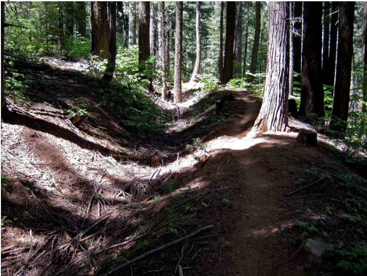
Focus on You Photography Nevada City – Pioneer Trail